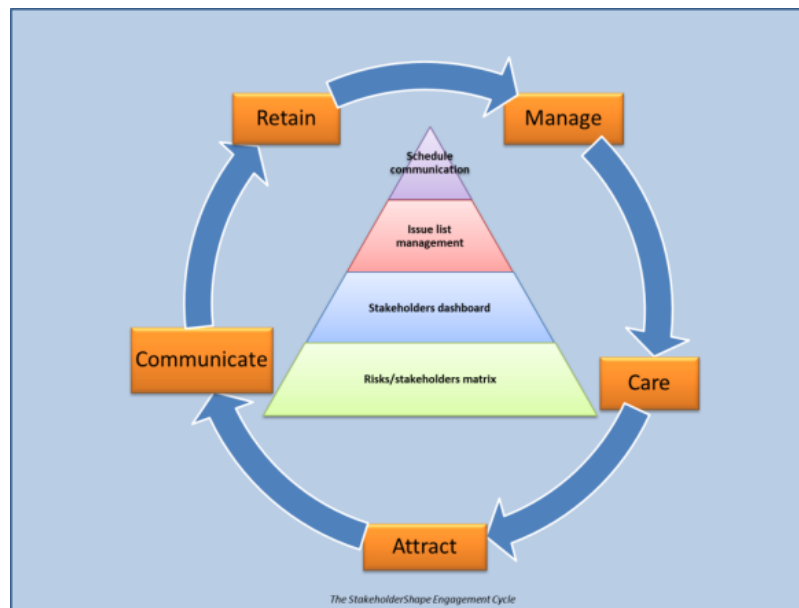
Fig. 1. Stakeholdershape iterative process (Bragantini and Caccamese)

The mapping of the stakeholders is, in this paradigm, functional to the building of the communication plan (Figure 1, Bragantini and Caccamese, 2015).